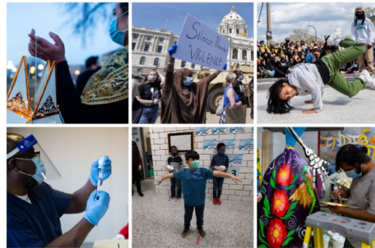
Minnesota’s Diverse Communities Survey.

The Lab also continues to work in partnership with others to bring facts into focus, including close collaborations with both MPR News and Marketplace. In addition, the Lab is the reporting partner for Penn State’s periodic “Mood of the Nation” polls , and hosts a data reporting fellow as a part of its partnership with Arizona State University’s Ten Across initiative .